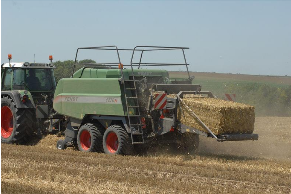
Big square baler