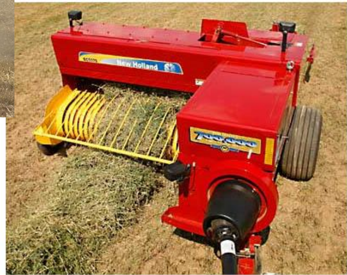
Conventional square baler