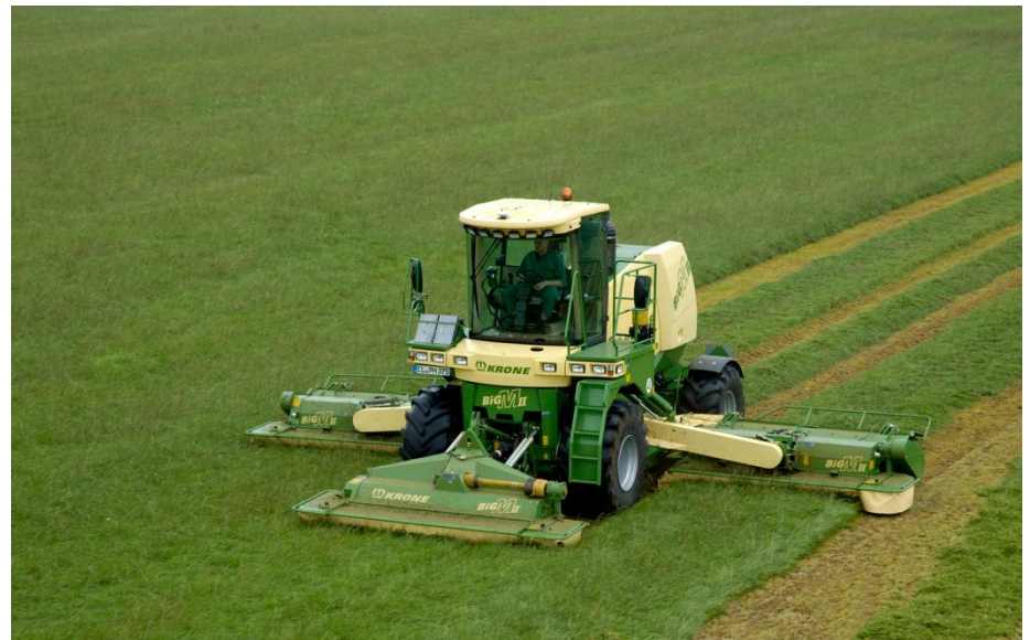
Self-propelled disc mower