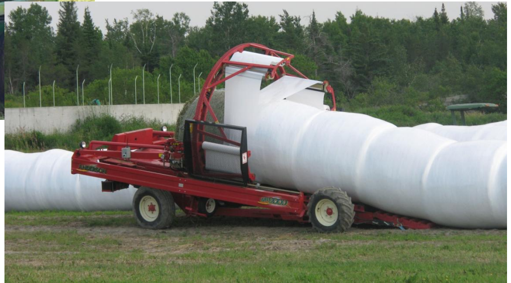
Bales in a tube