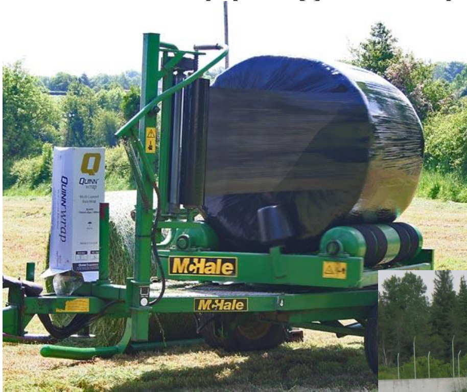
Wrapping bales one by one