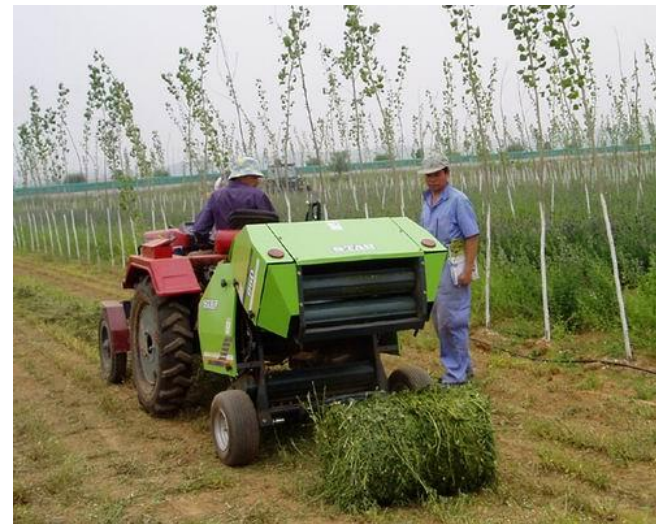
Mini round baler